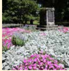
Twin Oak Drive