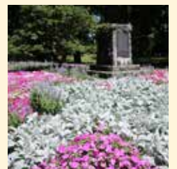
Twin Oak Drive