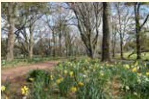
Twin Oak Drive

The Grotto is a hidden gem of the park, planted in 1938 and landscaped in 1996.