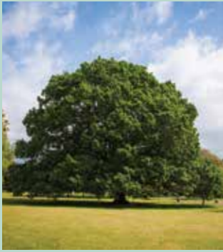
1 Algerian Oak