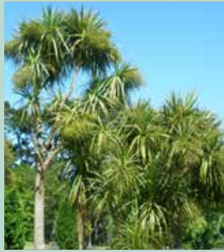
2 Cabbage Tree/Ti Kōuka*