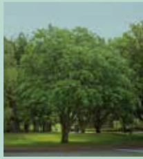
9 Horse Chestnut