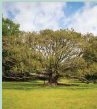
16 Moreton Bay Fig