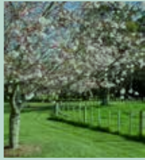
3 Cherry Blossom