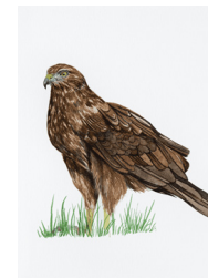
Swamp Harrier - Kāhu