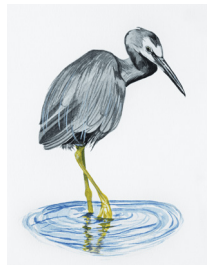
White-faced Heron - Matuku Moana