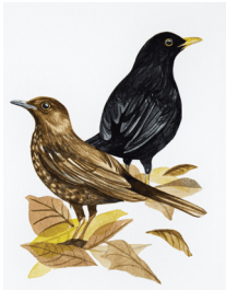
Blackbird - Manu Pango