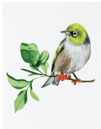
Silvereve - Tauhou