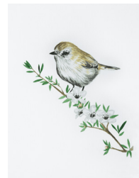
Grey Warbler - Riroriro