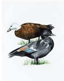
Paradise Shelduck - Pūtangitangi