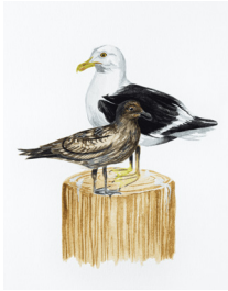
Black-backed Gull - Karoro