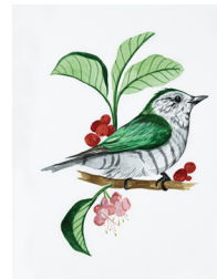
Shining Cuckoo - Pīpīwharau