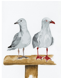
Red-billed Gull - Tarāpunga