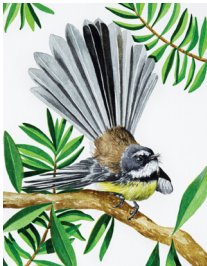
Fantail - Pīwakawaka