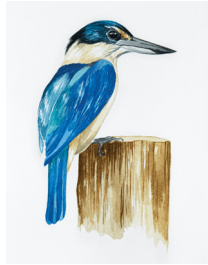
Kingfisher - Kōtare