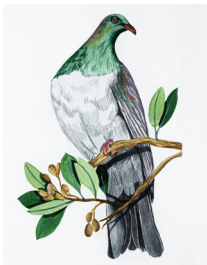
NZ Pigeon - Kererū