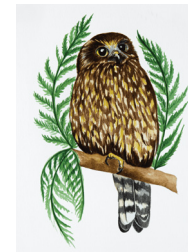
Morepork - Ruru