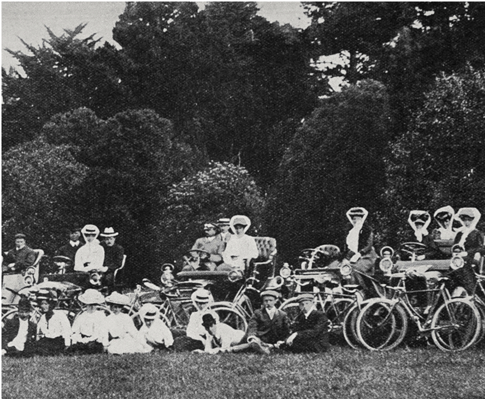
Auckland Libraries Heritage Collections Awns_19071121_p010_i001_b

When it starts to warm up, our arborists are getting the trees ready for summer. We're also dagging our sheep – it's a messy job but a really important one! Our events team are also preparing the summer events calendar - keep an eye out for it and pick up a copy from Huia Lodge or take a look on our website.